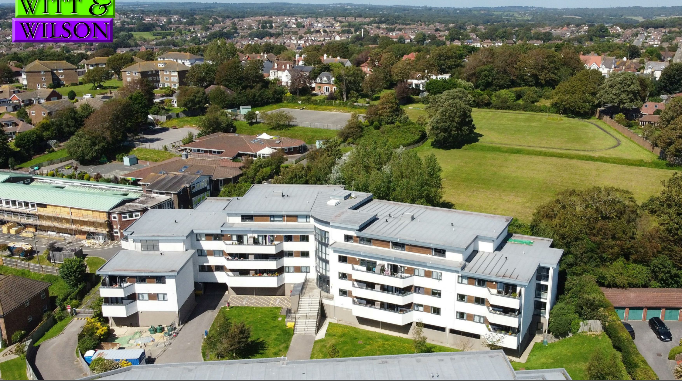
Flat 41 Compass House Buckhurst Road, Bexhill-On-Sea, East Sussex TN40 1FE £140,000